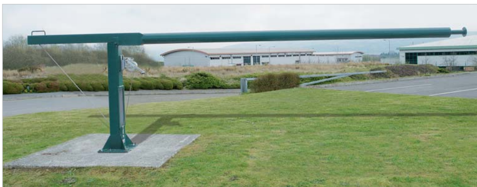
AW1859/6 in tilted position